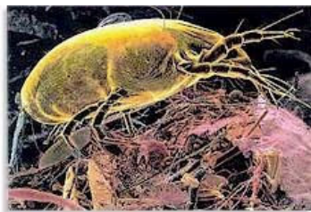
Ewww - Dust Mite

Over 40 million Americans suffer from allergies due to home bio-pollution. If you or your child has allergies or asthma, you already know that many things can bring on, or “trigger” an asthma flare or episode. Some things that trigger asthma attacks are called allergens. Some people get symptoms from only one allergen—like dust mites. For other people, more than one kind of allergen can trigger an episode.